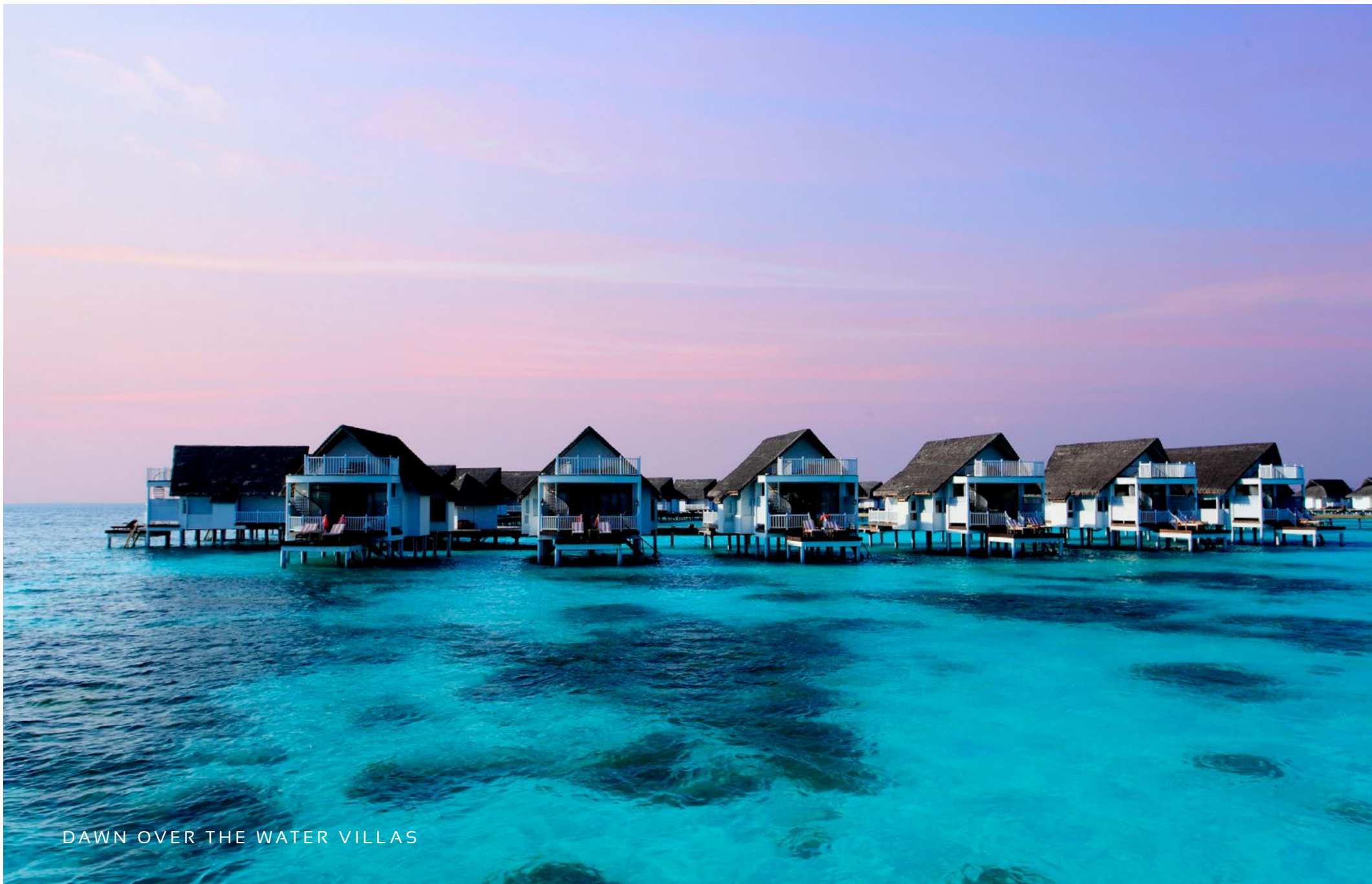
DAWN OVER THE WATER VILLAS