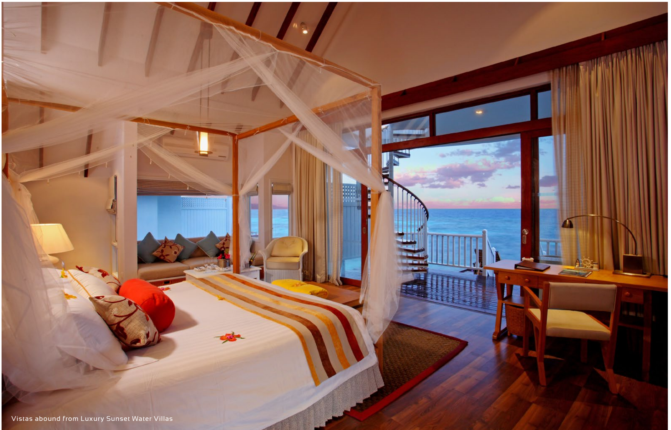
Vistas abound from Luxury Sunset Water Villas