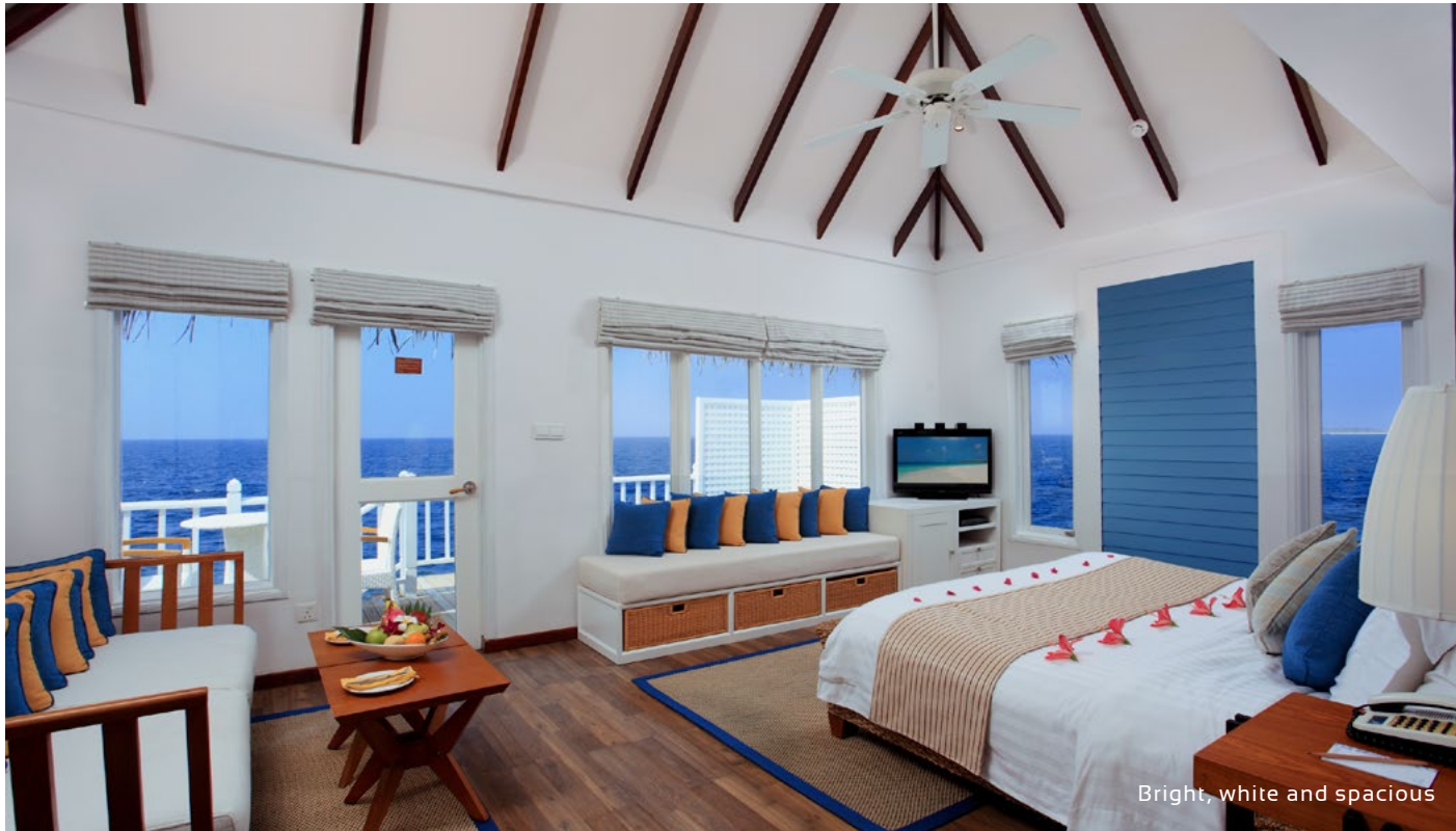
Bright, white and spacious