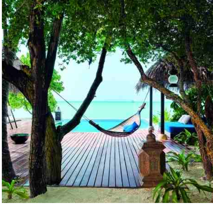
eluxe Beach Villas with Pool - 200 sqm: with an exclusive private outdoor area, these villas have their own stretch of beach and a direct access to the lagoon. Each of the luxuriously styled villas offers an oversized plunge pool, a private veranda with sun beds, a tropical outdoor shower in a private walled garden.

Deluxe Lagoon Villas with Pool - 94 sqm: Deluxe Lagoon Villas with its local texture and colour feature a private deck with a freshwater plunge pool and an alluring day-bed area with spectacular views. Located at the far end of the island, a double vanity bathroom, rain showers and bathtubs with an infinite view of the Indian Ocean add to the luxury.